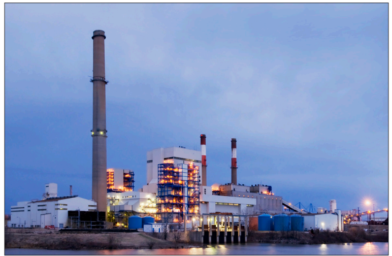
Thomas Hill Energy Center, AECI Power Plant

Lake Region always strives to provide quality service at the most affordable rates possible. Please read your monthly member newsletter or visit our website for more details regarding any LREC electric rate announcements.