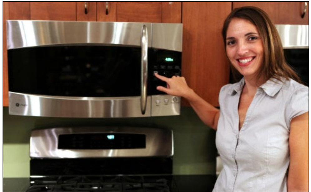
Make good use of your slowcooker, microwave, or toaster oven to save energy.

important that the metal reflectors under your electric stove burners stay free of dirt and grime.