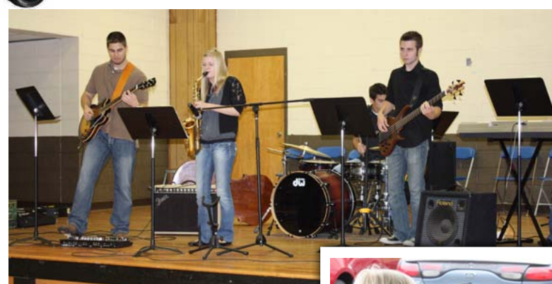
Jazz Band, Gibson Station