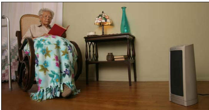
Keep your space heater at least 3 ft. away from yourself and flammable items like blankets, drapes, and rugs.

When used properly and safely, electric blankets and other heating devices can help keep you toasty during cold winter months. Here are a few safety tips for electric blankets and heating pads to keep in mind: