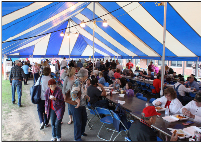
2013 Annual Meeting

Will Be Held on April 26, 2014 at the Hulbert High School