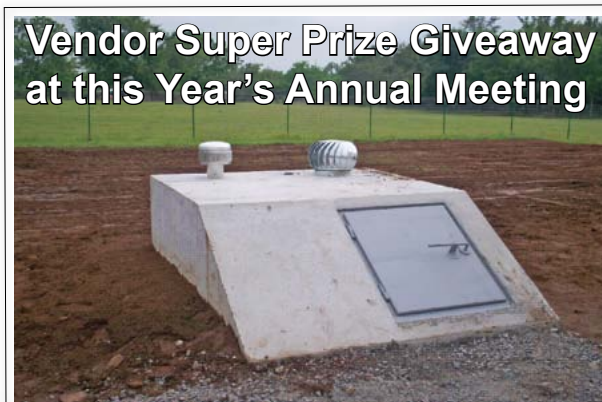
Storm cellar donated by Jerry's Excavation and H&H Septic Solutions