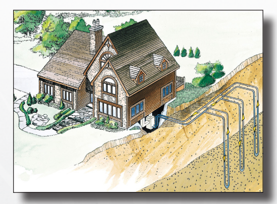
Example of a vertical, closed-loop system.

There are four basic types of ground loop systems. Three of these, horizontal, vertical, and pond/lake, are closed-loop systems. The fourth type is an open-loop. Your best option depends on climate, soil conditions, available land and local installation costs at your site.