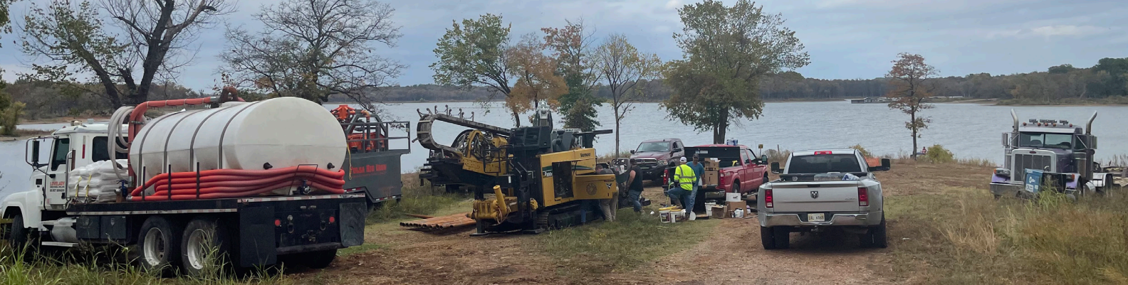
Lake Region contractors boring electric three phase line under Ft Gibson Lake, Whitehorn area over to Toppers back in the fall of 2023.