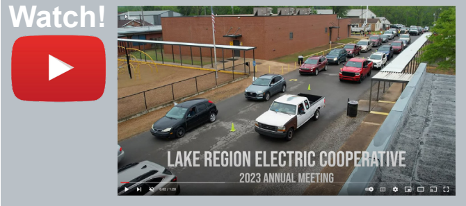
Get a bird's eye view (drone video) from this year's Annual Meeting. www.lrecok.coop/2023-annual-meeting