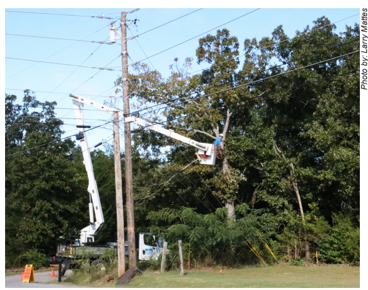
Dusty Jones, LREC right-of-way

Trees beautify our communities, provide habitat for wildlife, offer shade, and help keep our environment clean. But, trees that grow too close or into LREC's power lines can result in power outages and pose a safety risk. That is why LREC operates a vegetation management program that keeps our power lines clear of trees and ensures the following.