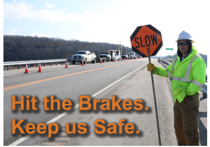
Brock Lubbers, LREC Apprentice Lineman

Orange cones, flashing lights, roadside flaggers. and warning signs can all indicate a work zone on the road ahead. Within these zones, LREC and LRTC (telecom) employees and contractors are often doing work to install or repair power or fiber lines. Workers in these situations are already facing the hazards of dealing with high voltage, and they increase their risk when establishing a work zone in the roadway. No matter how big the work zone, it requires drivers to pay attention to avoid a crash.