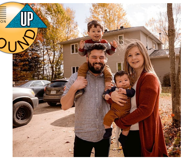
The next Operation Round-Up Meetings will be held: April 27, then again on July 27 and October 26. After the meeting, Lake Region will contact all the approved grant recipients.

This foundation has allocated funds to fire departments, senior citizen centers, school programs, agencies for the disabled, youth programs, and individuals.