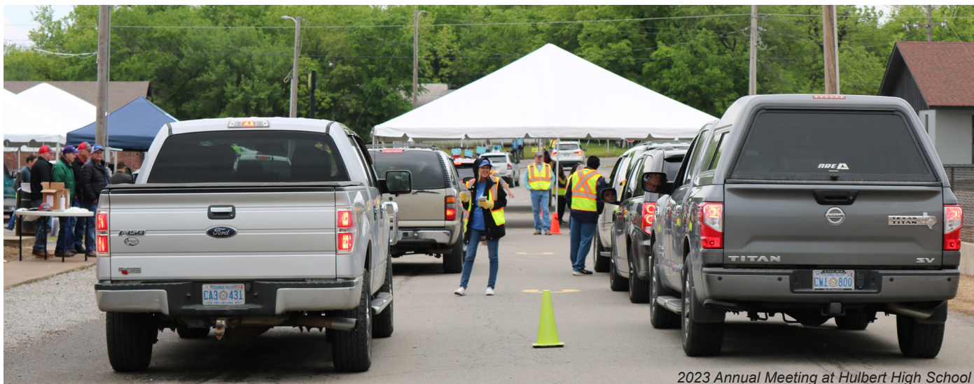
2023 Annual Meeting at Hulbert High School

Lake Region Electric Cooperative (LREC) is your member-owned rural electric cooperative. It belongs to you and your fellow members. LREC's success depends on the guidance of its board of trustees, comprised of seven democratically elected individuals from the membership.