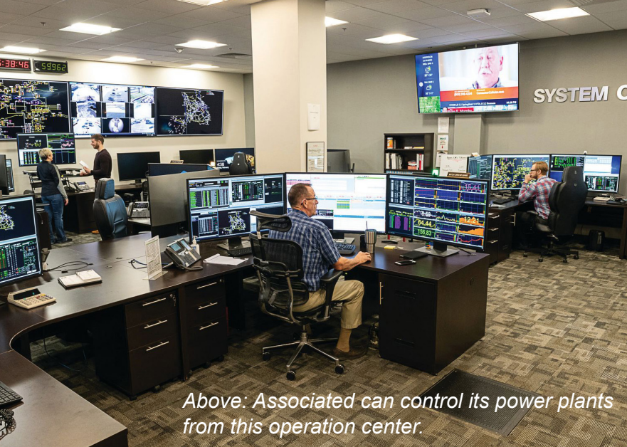
Above: Associated can control its power plants from this operation center.

“ The balance and flexibility of our diverse generation fleet allows us, at times, to have significant volumes of excess generation when the price of selling power to nonmember is beneficial. That’s good for Associated and its members. ”